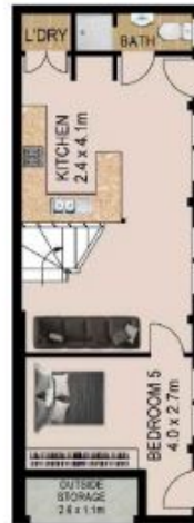
FLAT GROUND FLOOR