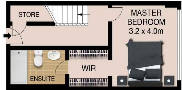
GROUND LEVEL THREE