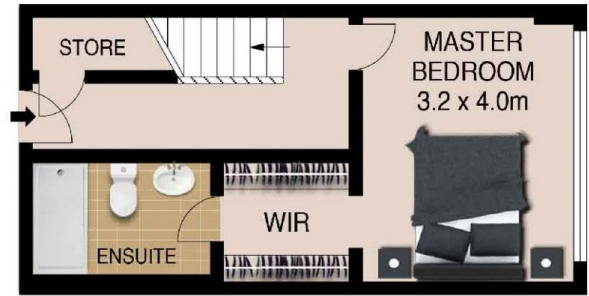
GROUND LEVEL THREE