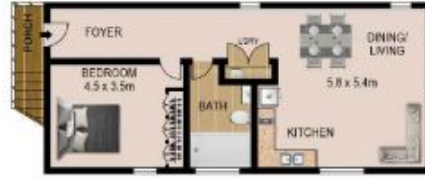
FIRST FLOOR (GRANNY FLAT)