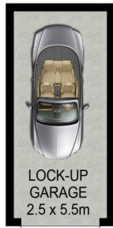
BASEMENT (LEVEL ONE)