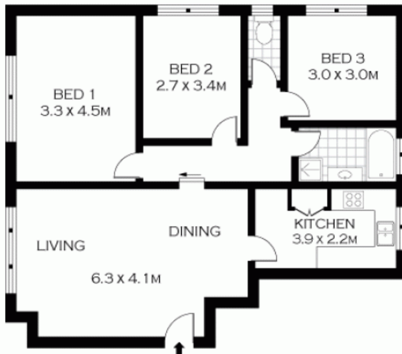
ELEVATED GROUND FLOOR