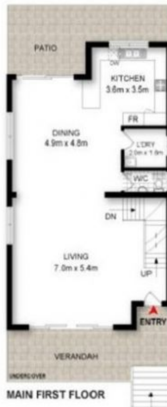
MAIN FIRST FLOOR